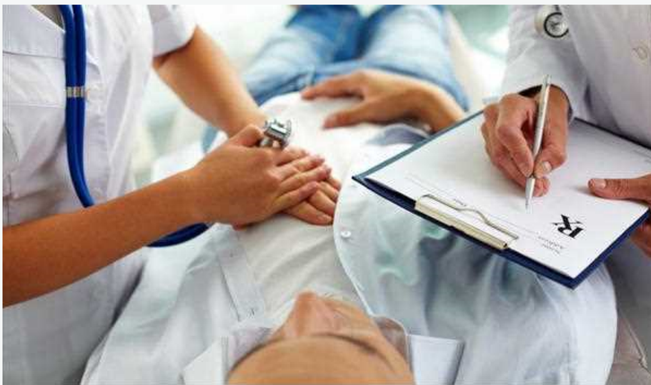
HemorrhoidsHemorrhoidHemorrhoid TreatmentExternal HemorrhoidsBowel