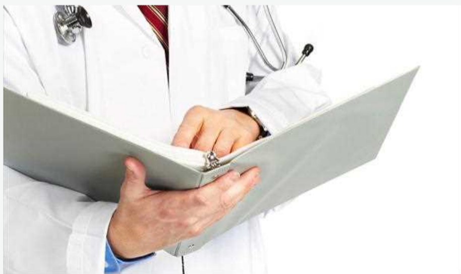
HemorrhoidsHemorrhoidBowelRubber Band HemorrhoidHemorrhoid

The following tips can help you with your hemorrhoids problem, yet if you truly want to be able to receive the best results a well-known program to remove hemorrhoids is really recommended. click here and find out about a step-by-step information to eliminate hemorrhoids quickly.