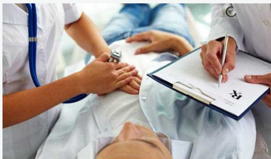
Hemorrhoids Internal Hemorrhoids Stop Bleeding Hemorrhoids External

It is very important to change your eating and bowel habits to prevent hemorrhoids from happening again. If any natural material is applied to the anus, it's going to quickly absorb into the bloodstream and have a direct effect on the central nervous system. This can be of great benefit when correct organic medicinal extracts are utilized. Plant medicine has been formulated coming from strictly certified organic medicinal plant extracts. Grow medicine is a highly effective cure with regard to hemorrhoids and does not irritate rectal muscle and strengthens immune functionality.