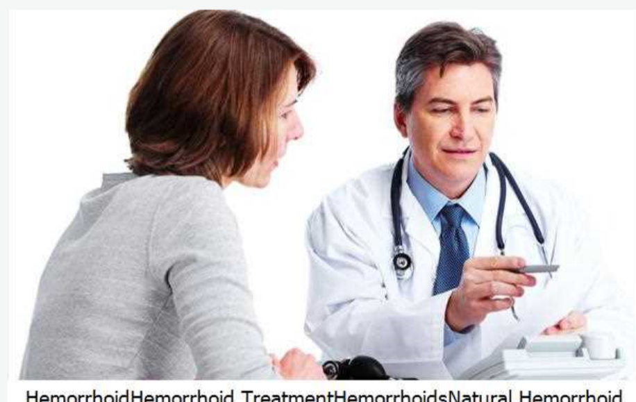
HemorrhoidHemorrhoid TreatmentHemorrhoidsNatural Hemorrhoid