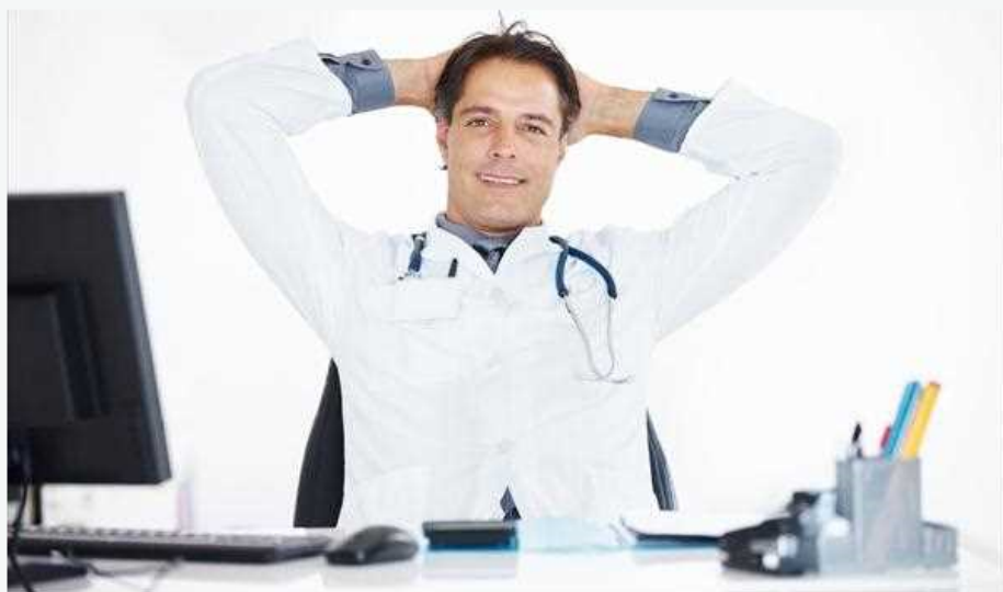
HemorrhoidsNatural Remedy HemorrhoidsBowelHemorrhoid

Venapro makes use of only natural ingredients. These include herbs and minerals which work by triggering a response from the immune system. This then reduces the pain that is associated with hemorrhoids. The Venapro Ingredients are some of the most effective hemorrhoid treatments currently available.