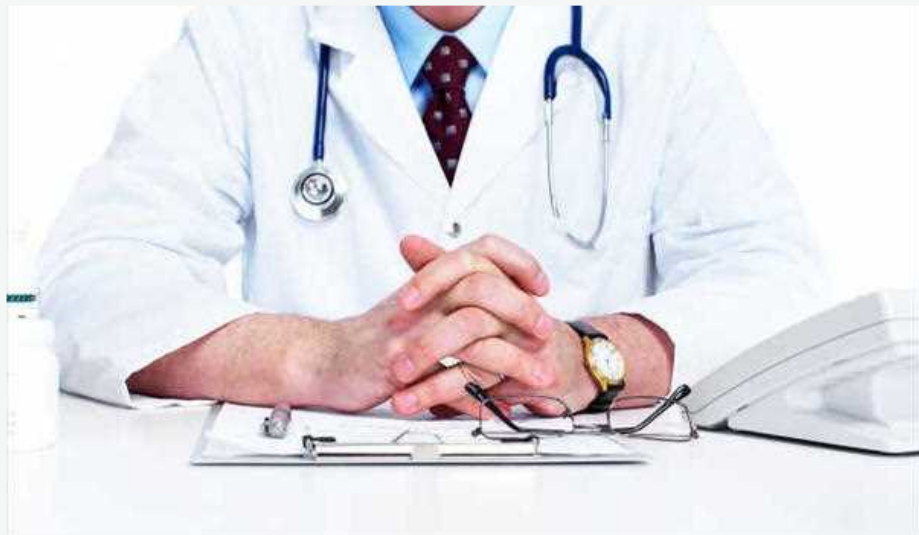
External Hemorrhoids Pictures

Any of the above suggested hemorrhoid treatment can really guarantee the healing of the hemorrhoids as well as lessen the possibility of their reappearance.