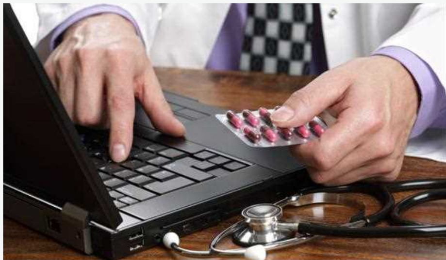
Heavy Lifting Piles

How would you understand that you are going through this? You can possibly notice occasional itching, burning sensation and throbbing discomfort and presence of bright red blood on your bar stool and tissue paper from time to time. You might also observe a bulge of soft tissue that protrudes outside of your anus. There's no need for you to worry because you may can make using remedies that could be located in your home to be able to handle this issue. There is no need to be afraid about it condition even when it is so not easy to treat. It is possible to only perform no matter what to avoid it from worsening and also to minimize your flare-ups.