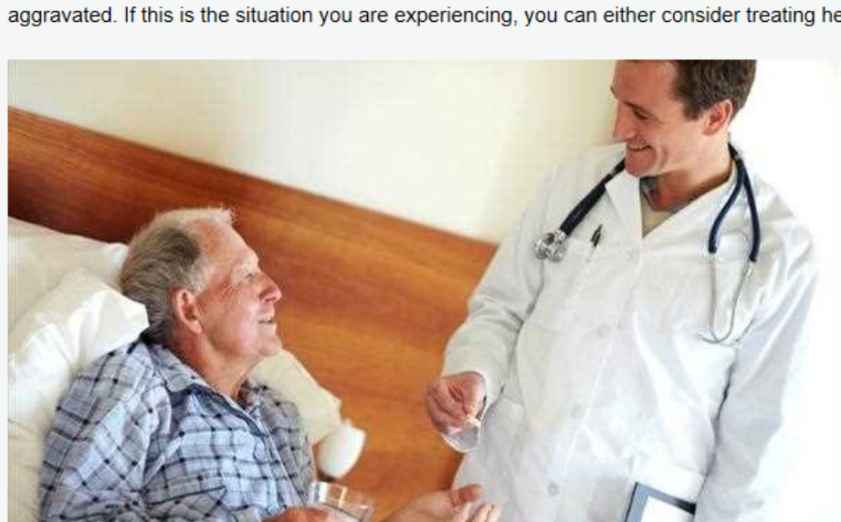
Thrombosed Hemorrhoid Treatment

Hemorrhoid victims will usually say that the prolapsed or stage 3 and 4 hemorrhoids cause the most pain simply because they can be externally aggravated. If this is the situation you are experiencing, you can either consider treating hemorrhoids at home or seek the advice of a doctor.